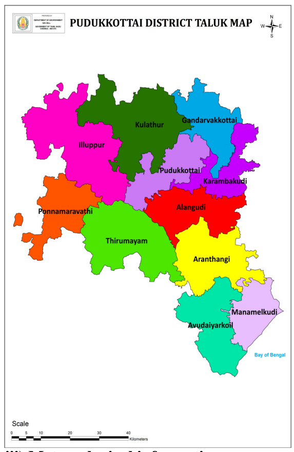
iii) Meteorological information

The average rainfall in Pudukkottai is 821 mm. During northeast monsoon this district receives the highest rainfall of 397 mm followed by, South west monsoon with 303 mm of rainfall. The summer and winter rainfalls are 81 mm and 40 mm respectively. Average rainfall shows that the rainfall is highest in the south eastern part of the district, which includes the coastal blocks of Manalmelkudi and Avudayarkoil. gradually decreases towards the northeast where the average annual rainfall is found to be the lowest in Malaiyur. The temperature is very high during summer season, low during the winter season and moderate during other months.